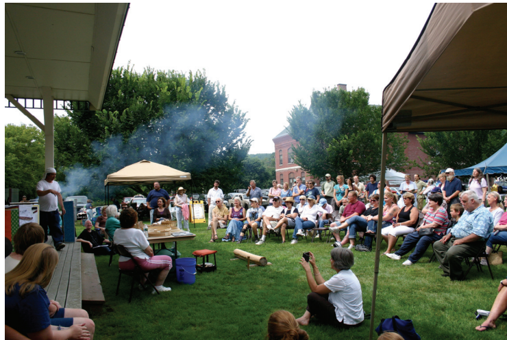
Abenaki Day 2011

So come on down to the Point, where the White River meets the Connecticut River; the site of an old Abenaki canoe village in 1760-1761.