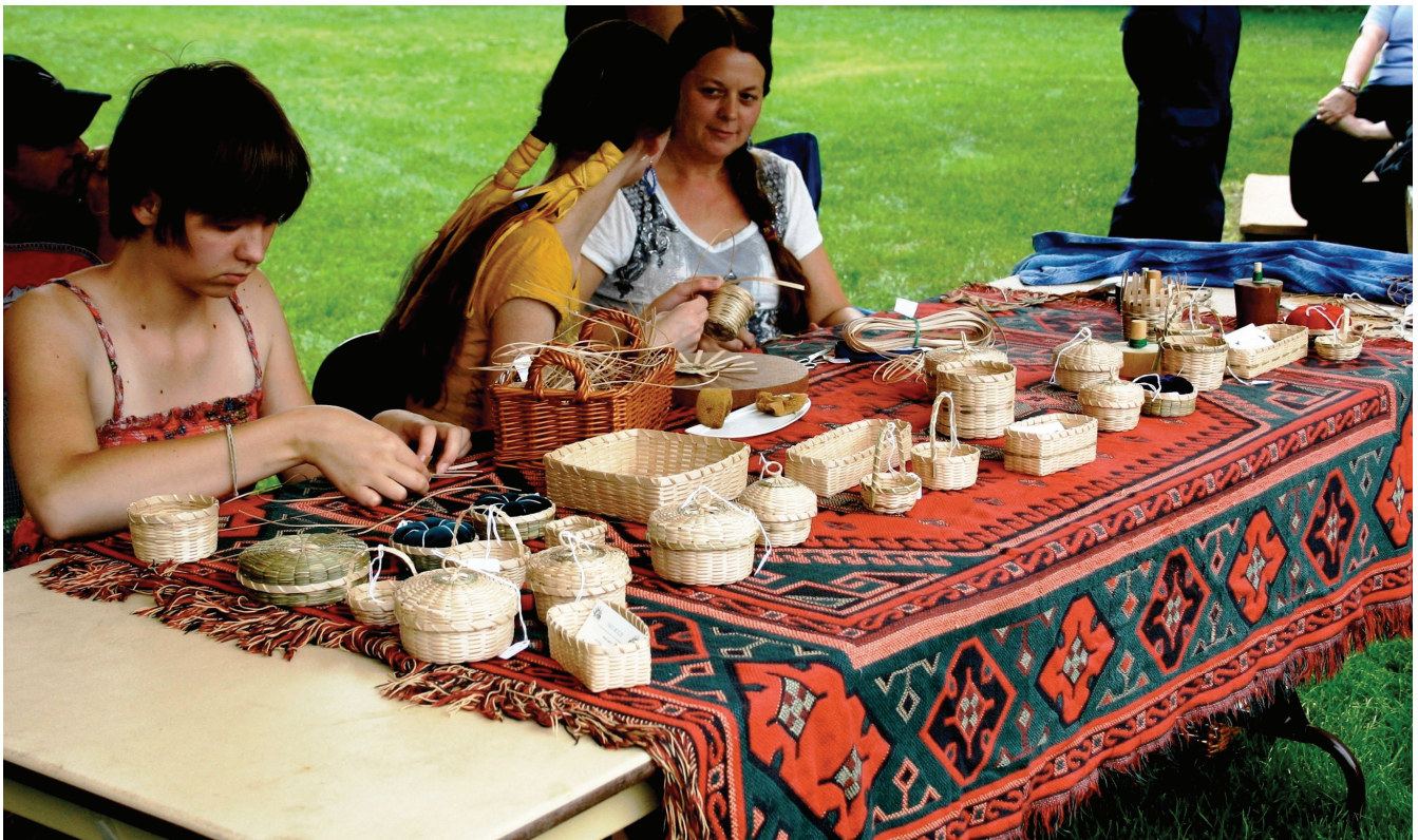
Abenaki-Boles Family—See front page story