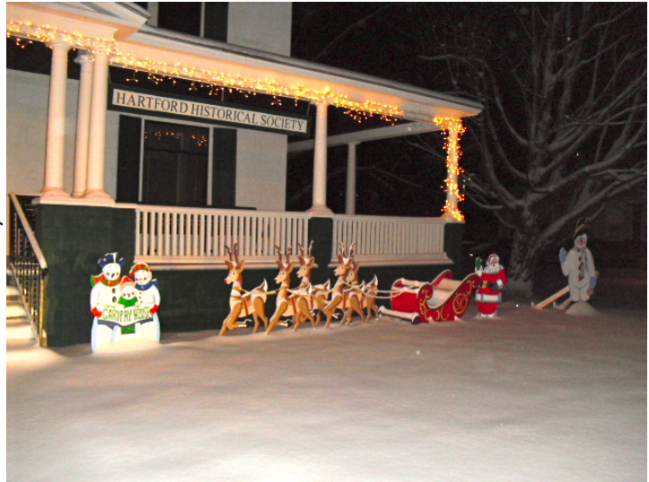
Lawn Ornaments in the snow (above).