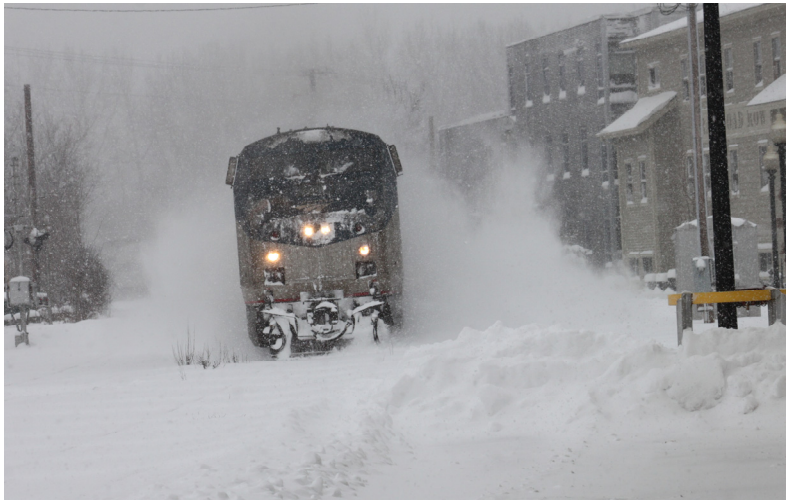
Amtrak Train #55, White River Junction, Vermont, in major winter storm on December 27, 2010

The hall is handicap accessible. Refreshments will be served following the presentation.