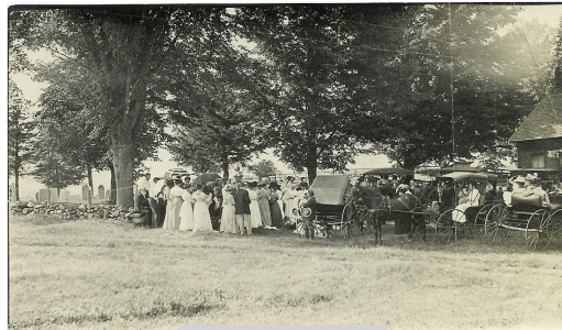
From 1911 Celebration

As you probably know, when this area was a howling wilderness it was partitioned off by the King of England. Actually it was done by Benning Wentworth, the Governor of 'New Hampshire' Province. He signed the Charters for the new township in groups, and ours was on July 4 th (along with Norwich, Lebanon, Thetford, Fairlee, Lyme, Hanover, Hartland, Windsor, Enfield, Canaan & Plainfield). These towns are referred to as the Middle Grants as they were chartered mid-way in the granting period and are mid-way up the Connecticut Valley – in the middle of the territory Benning Wentworth considered 'his' province. There is a rumor that ours was the first that day, or the first in Vermont, but who can tell? He did not put the time on them!