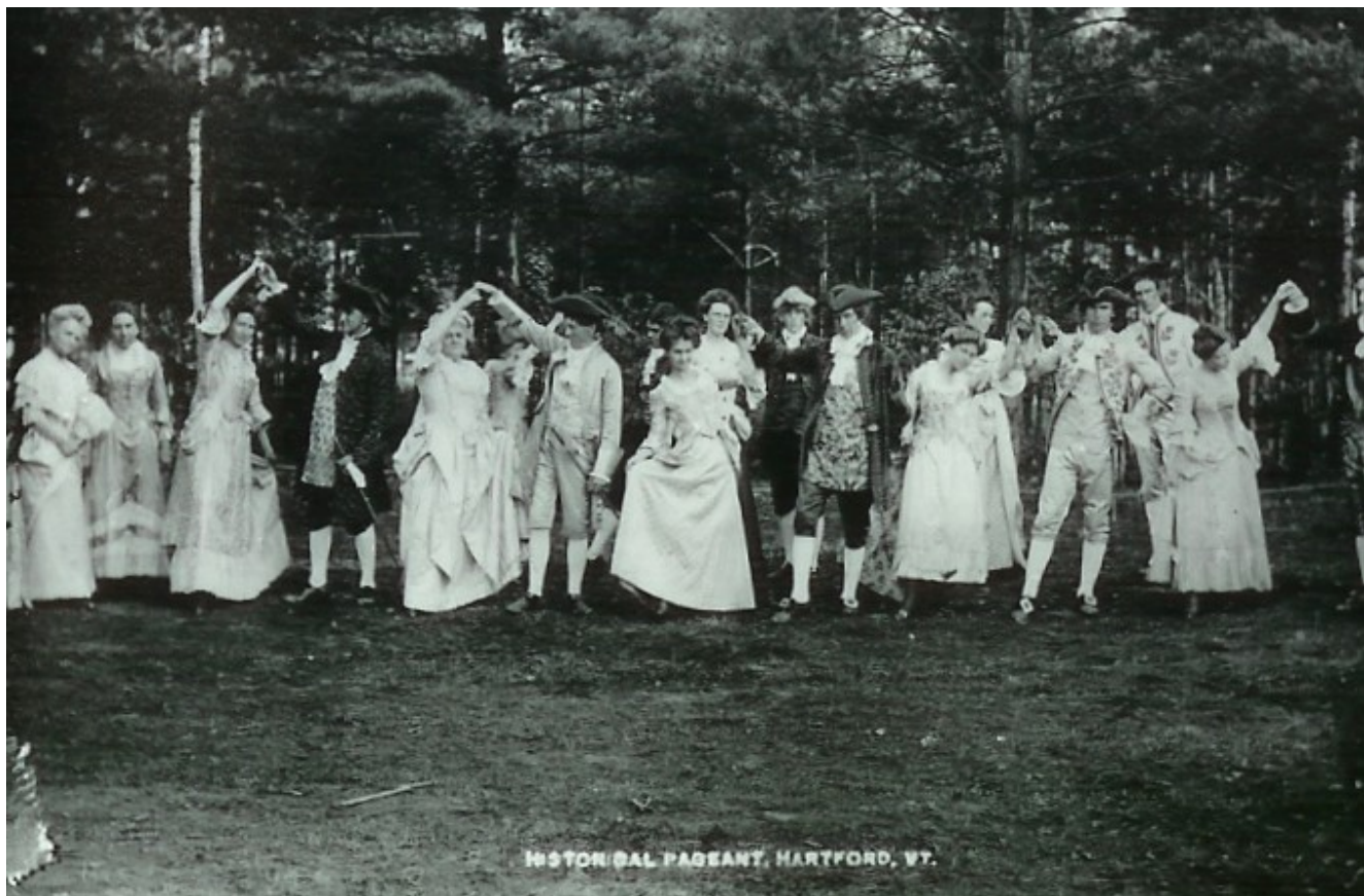
Scene from the 1911 Hartford birthday celebration.