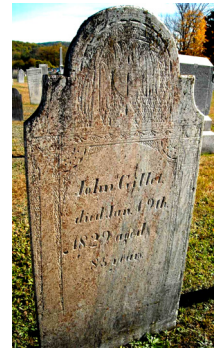
B 1745, d 1829; Christian St Cemetery