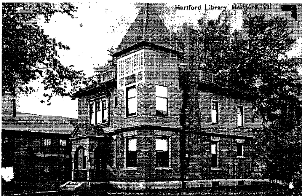
Hartford Library, Hartford, Vermont