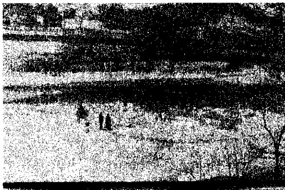
Filming of "Way Down East"